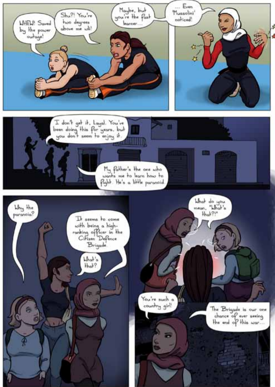
Scene from Part II 'Malaak: Battles and Scars'. Malaak is learning martial arts.